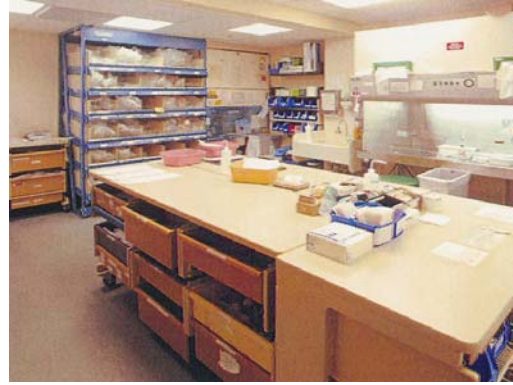
After — Clean room portion of IV Pharmacy, with laminar flow hoods and central work table.

Swedish Medical Center, First Hill 747 Broadway Seattle, WA 98122-4307