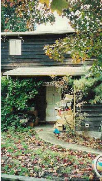
Before: Front Entry