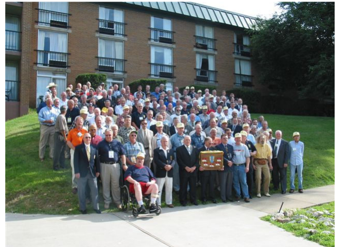
Group Photo from Last Reunion