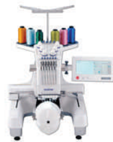
My Brother PR600 gets the job done.