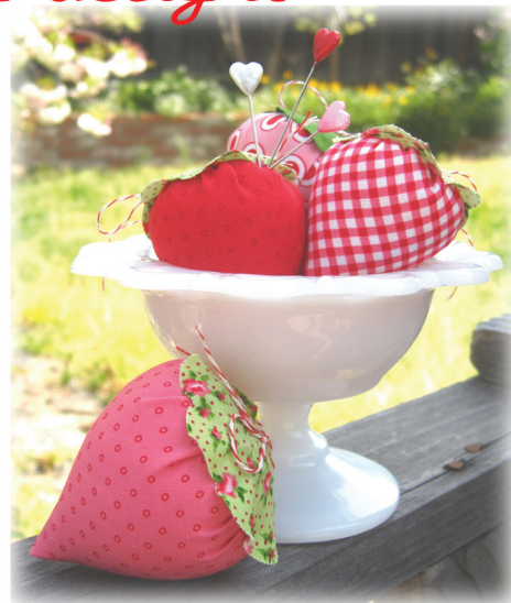
© 2011 Pam Kitty Morning and Late Bloomer Quilts

Pattern not for individual sale. pamkittymorning.blogspot.com www.latebloomerquilts.com