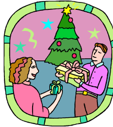
Thanks for all your donations!

Signs and Wonders The Quinn House 120 So. Perry Street Lawrenceville, GA 30045 Troop 648