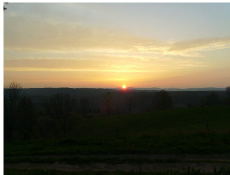
Be thankful for each sunrise we have and the beauty of America! Picture from the Fowler farm.

If we would just step back in time and remember the hardships those first settlers had to en-