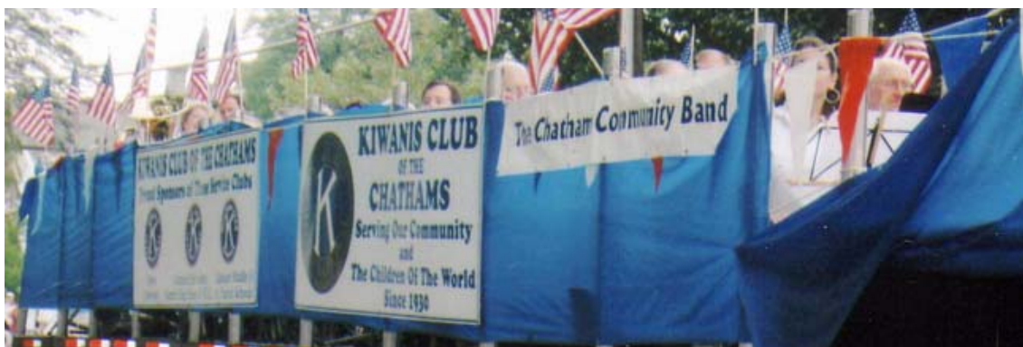
The Big Band Sound can be heard, and partially seen. The sound is great, and visibility will be improved next year. Banners announce the organizations we sponsor.