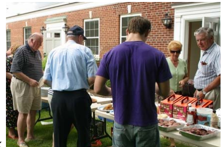
Steak, salads, and fruit pies, prepared by our Rotarian hosts.