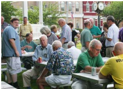
Good fellowship shared by members of the Kiwanis and Rotary Clubs.