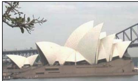
Sidney Opera House