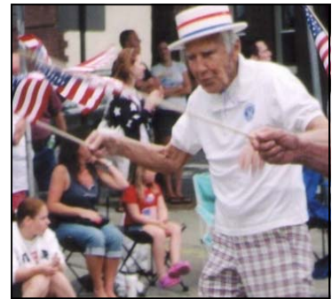
July 4th Parade and Flags

his flag. Dad was so patriotic throughout his whole life. It was an honor for me to walk in the parade with him and his fellow Kiwanians and was welcomed as an "honorary" member of the club for the day. After walking the whole route in the heat and humidity, he jumped right in and helped clean up the float.