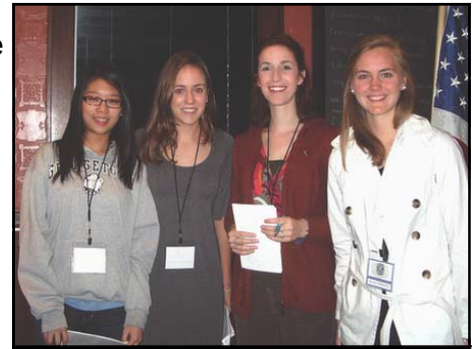
CHS Officers & Advisor: (L-R) Vice-Pres, Treasurer, Advisor & President.