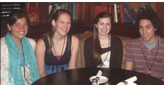
Madison High School Officers– Vice President, President, Secretary, and Treasurer.

At our May 25 breakfast meeting, we hosted a visit by