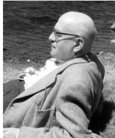
Theodor W. Adorno