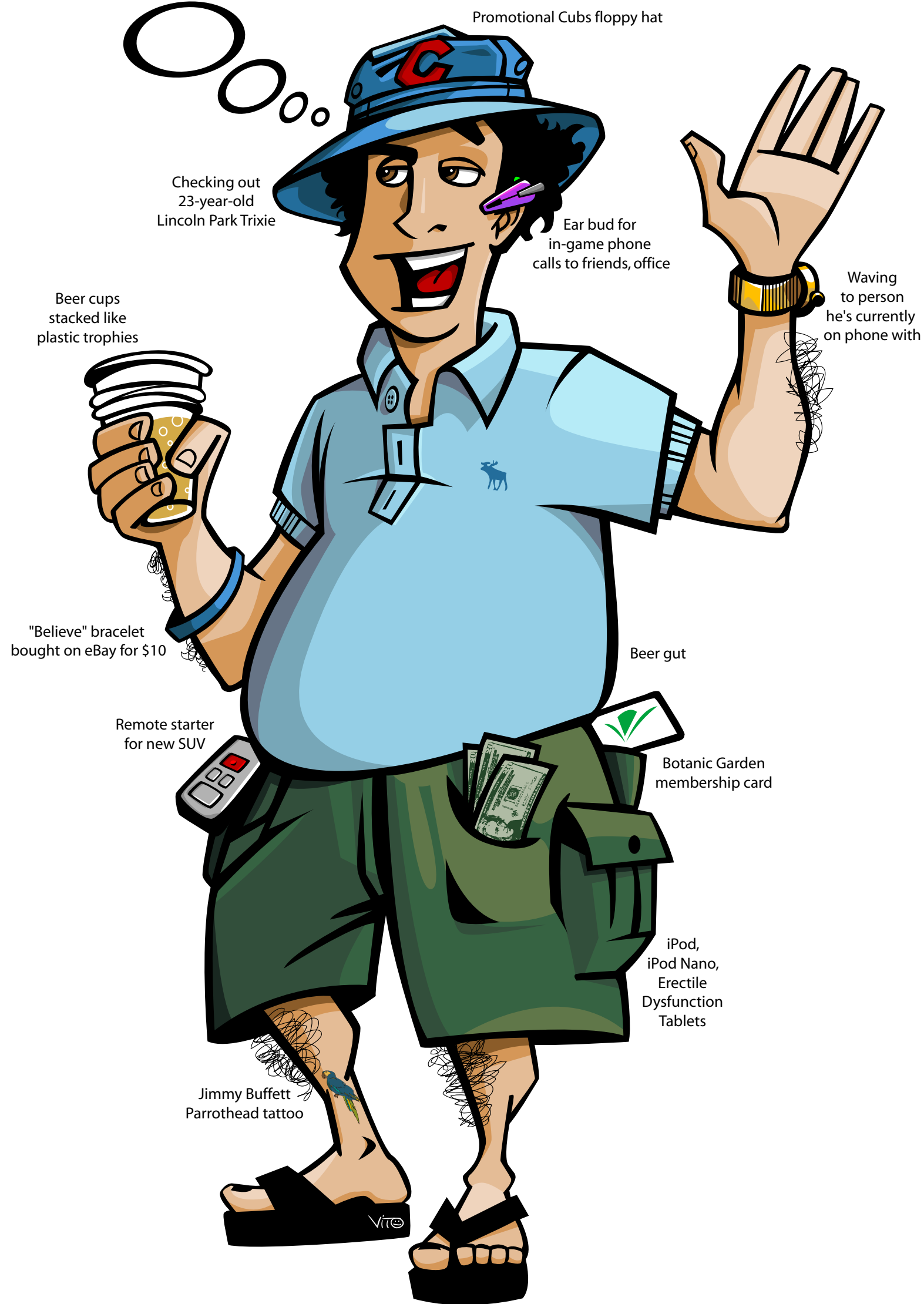
Promotional Cubs floppy hat