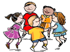
Kids In Church