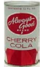
1G - A340-1

Always Good - FT/PT Pre-zip/zip 1965 9 Cherry $50-60