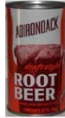
R1 1G - A160-0

Maspeth, NY Adanac - ? Pre-zip 1960's 9 Club Soda $500+