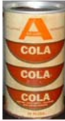
R0 1G - A60-1