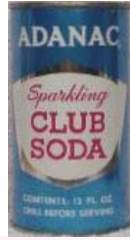
R0 1G - A130-1

Maspeth, NY Adanac - ? Pre-zip 1960's 9 Club Soda $500+