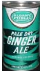
R3 OG - A220-1

Albany, NY Albany Public - FT/PT Pre-zip/zip 1968 9 Cream $100-125