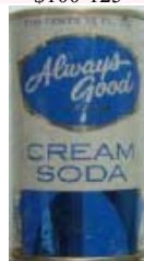
1G - A340-1

Always Good - FT/PT Pre-zip/zip 1965 9 Cola $50-60