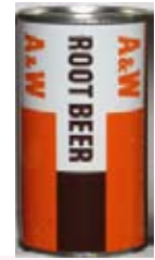
R2 1G - A40-5

R4 = Rarely seen on grade - Available as a dumper