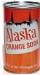
OG - A200-1

Alaska - FT Pre-zip 1958 9 Orange $18-21