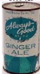
1G - A340-1

Always Good - FT/PT Pre-zip/zip 1965 9 Cream $50-60