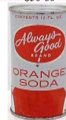
1G - A340-1

Always Good - FT/PT Pre-zip/zip 1965 9 Imitation Grape $50-60