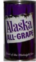
R2 OG - A200-1

Alaska - FT Pre-zip 1958 9 Club Soda $10-12