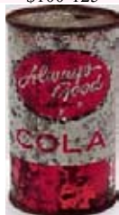
1G - A340-1

Always Good - FT/PT Pre-zip/zip 1965 9 Cherry Cola $50-60