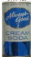
1G - A340-1

Always Good - FT/PT Pre-zip/zip 1965 9 Cola $50-60