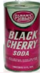
R3 OG - A220-1

Alaska - FT Pre-zip 1958 9 Root Beer $10-12