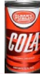
R3 OG - A220-1

Albany, NY Albany Public - FT/PT Pre-zip/zip 1968 9 Black Cherry $100-125