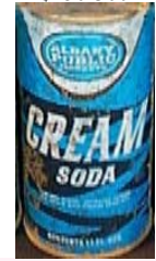
R3 OG - A220-1

Albany, NY Albany Public - FT/PT Pre-zip/zip 1968 9 Cola $100-125