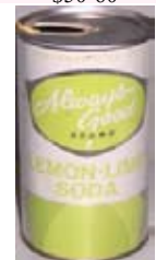
1G - A340-1

Always Good - FT/PT Pre-zip/zip 1965 9 Orange Soda $50-60