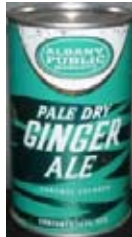
R3 OG - A220-1

Albany, NY Albany Public - FT/PT Pre-zip/zip 1968 9 Cream $100-125