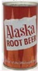
OG - A200-1

Alaska - FT Pre-zip 1958 9 Orange $18-21