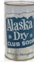
OG - A200-1

Adirondack - FT/PT Pre-zip/zip 1965 9 Root Beer $500+