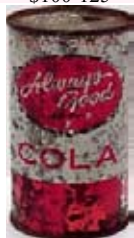
1G - A340-1

Always Good - FT/PT Pre-zip/zip 1965 9 Cherry Cola $50-60