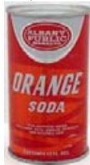
R3 OG - A220-1

Albany, NY Albany Public - FT/PT Pre-zip/zip 1968 9 Grape $100-125