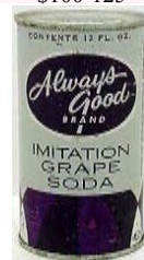
1G - A340-1

Always Good - FT/PT Pre-zip/zip 1965 9 Ginger Ale $50-60