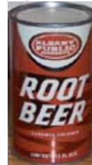
R3 OG - A220-1

Albany, NY Albany Public - FT/PT Pre-zip/zip 1968 9 Orange $100-125