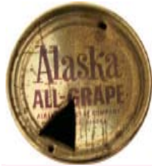
Top lid for previous can Other flavors may show corresponding flavor lids

Alaska - FT Pre-zip 1958 9 Grape $250-300