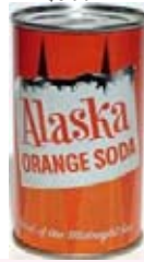
OG - A200-1

Alaska - FT Pre-zip 1958 9 Orange $18-21