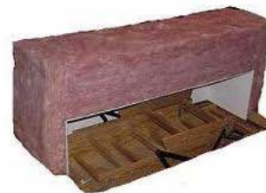
add your desired amount of insulation over the cover (insulation not included)

The Attic Stair Cover That Puts The Lid On Air Leaks!