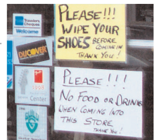
We discourage the use of hand-made signs such as this.