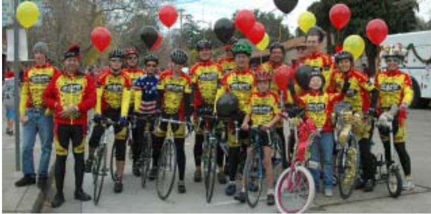
LGBRC members await the start of the 2004 parade.

URL: http://www.lgbrc.org e-mail: lgbrc@topica.com