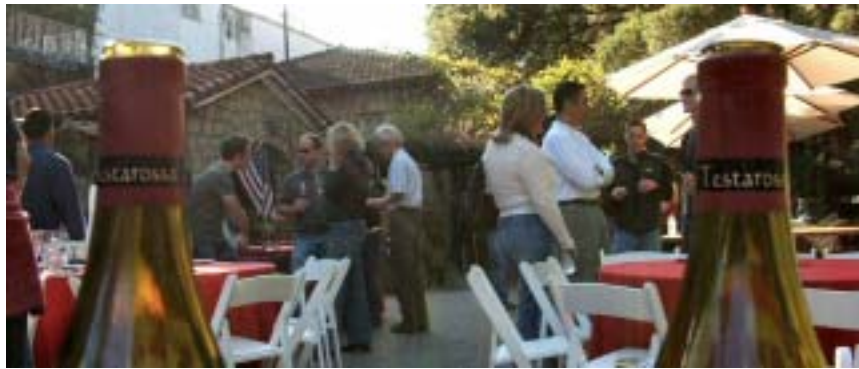
Testarossa Vineyards hosted a party for LGBRC members and their families on October 23.