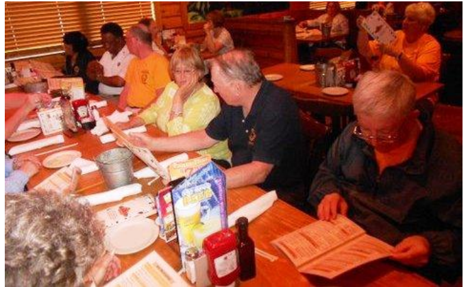
Lions trying to decide what to order at their annual dinner out!