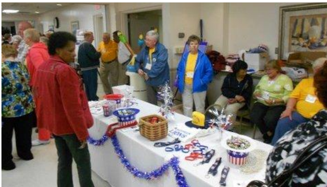
Another great Hospitality Room!