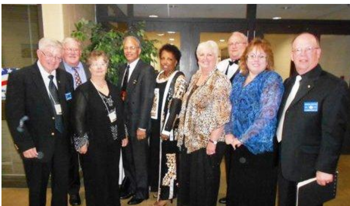
The Aberdeen Lions clean up nicely!