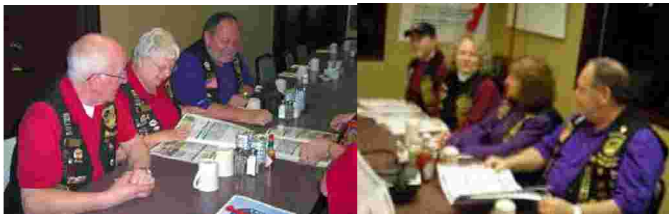
Jan 2008 Our first meet at the Hangar Inn