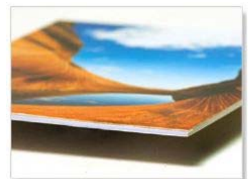
Canvas on Matboard