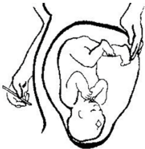
Right Occiput Posterior (ROP)