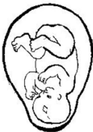
Left Occiput Posterior (LOP)