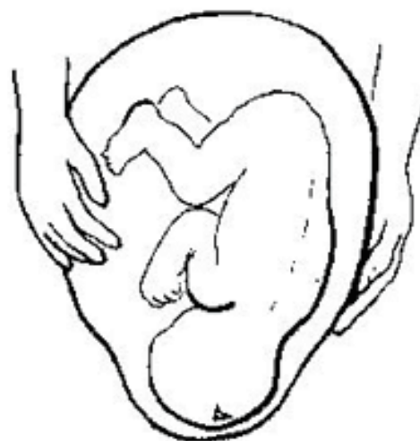
Left Occiput Anterior (LOA)