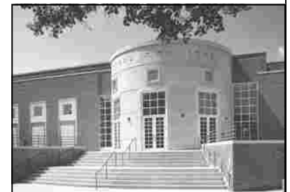
Temple Emanuel in Newton

Temple Emanuel is a beautiful building with excellent meeting spaces. They have provided us space to house our resources as well as host our meetings. It is a convenient location—only a short ride from Center Street near the intersection with Route 30 or from the Mass Pike Exit 17—with ample parking in its parking lot and on nearby streets. Their audio/visual equipment is also of high quality.