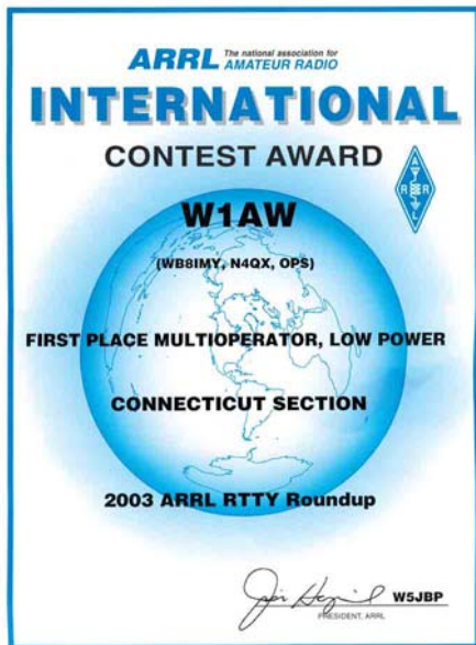
A contest certificate like this one is just one of the rewards of entering a contest.

and dramatically improve your success rate. Keep a list of stations by frequency to save time in finding them and to avoid working them a second time.