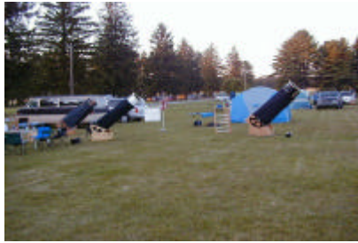
Star Parties during the summer months