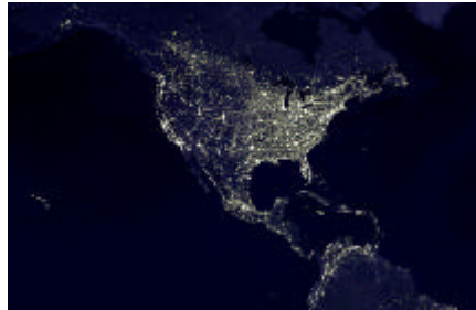
This composite night time photo taken by the DMSP satellites shows how prevalent light pollution has become.

With light pollution still on the rise, viewing the stars and the constellations is becoming more difficult. Many city dwellers have never seen a starry, night sky. As the population spreads into the rural areas, so does the light pollution. Light pollution is all over the world.