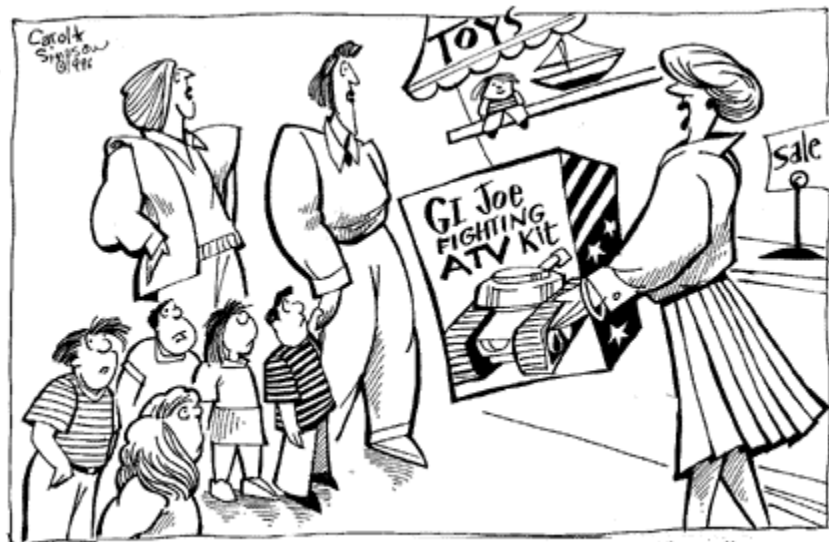
"Well, it's American-made after your child assembles it."