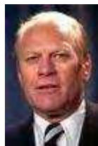
Former President Gerald R. Ford dies at 93

In 1975, then President Gerald Ford made the dedication of the Philadelphia Bulk Mail Center to public service. The plaque is visible in the foyer, to the right of the entrance. Ford was House minority leader when President Nixon chose him to replace Spiro Agnew, who resigned, as vice president in 1973. Ford became President on Aug. 9, 1974, when Nixon resigned amid the Watergate scandal.