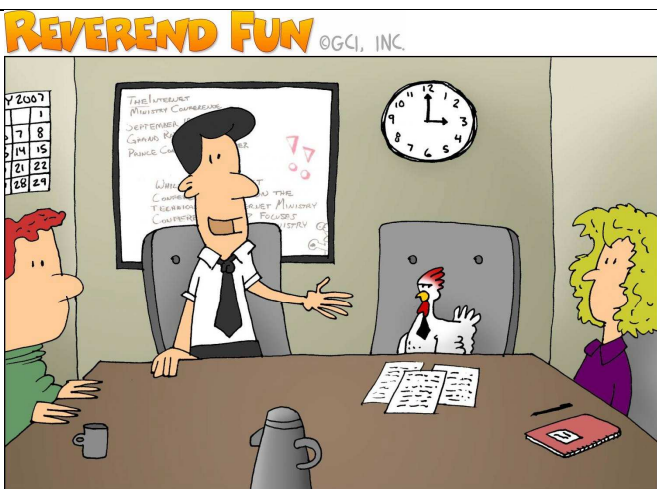
OUR NEWEST COMMITTEE MEMBER, CHICKEN LITTLE, HAS SOME RADICAL NEW CONCEPTS FOR A NEW FEAR-BASED CHURCH MEMBERSHIP GROWTH CAMPAIGN CCLI License #1577309

Can't wait to see you in God's Big Backyard!