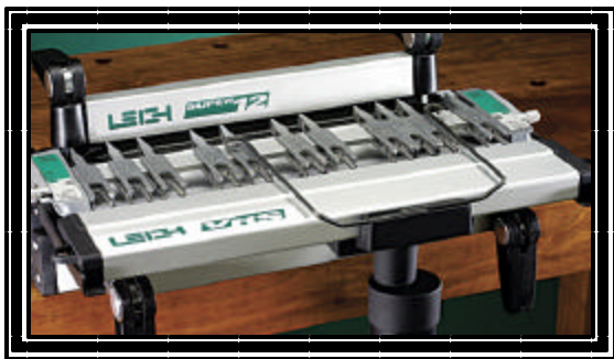
The New Super 12 Leigh Dovetail Jig With Dust Collection Accessory.

Cutting quality dove tails is challenging, even with a quality jig such as the Leigh jig. It takes lots of practice and patience to