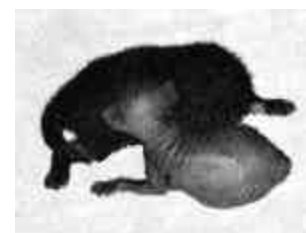
Prune's Brandy Took's litter one week old, normal with hairless male

compliment of functional sweat glands, the normal compliment of primary and secondary follicles (in this case all primary follicles functioned producing a reduced hair shaft i.e. down, all secondary shafts were non-functional). So the only difference clinically between a Sphynx and normal cat is a quantitative one i.e. lack of hair. Thus the only statement that can be made with respect to allergies is also a quantitative one based on gross dander i.e. if the allergy is proportional to the gross dander level such that the more dander the greater the response then the Sphynx is an acceptable substitute since the lack of hair lowers the gross dander level to a minimum.