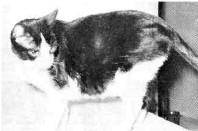
Elizabeth of Prune, Prune's dam and grand-dam of all Sphynx cats in existence

Case I. Family, alcoholics (mother and father). Father violent asthmatic (attacks related to emotional environment), one daughter with intense 'normal' allergies. One Sphynx was with the family two months, only the daughter had a response (mostly to 'odour' products) but could tolerate and partially handle the kitten. There was then a 'crisis' and violent asthmatic attack and the cat returned home. In this case I'm positive that the cat was 'celebrated cause' i.e. had nothing to do with the attack clinically.