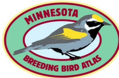
2009 sleeve patch

The MN Breeding Bird Atlas is gearing up for our first season in spring 2009. A breeding bird atlas is a comprehensive, systematic survey of the occurrence and distribution of breeding birds, conducted by citizen scientists. Our goals are to map the occurrence and breeding status of all species in the state,