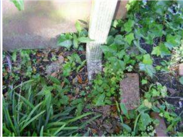
1.4 Picture 2