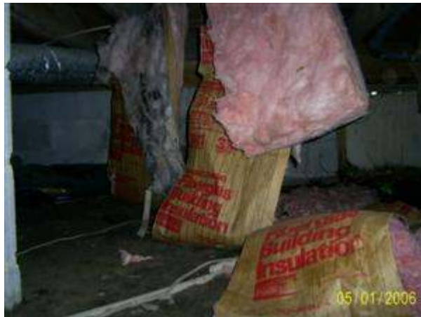
9.5 Picture 1

(Picture 1) Wet insulation hanging down toward the rear of the home. (Picture 2) Shows insulation incorrectly installed in several areas under the home. Kraft facing should be installed 'toward the heated area' not toward the ground. Vapor barrier (plastic) on crawlspace ground is missing. A vapor barrier provides added protection to floor system from moisture or dampness that can enter from ground. Recommend repair or replace as needed using a qualified person.