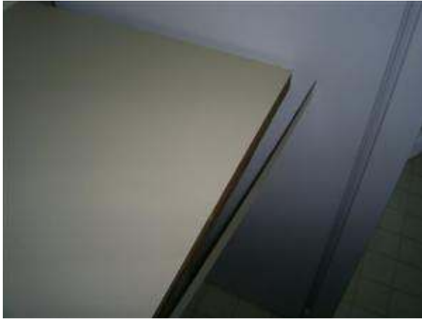
5.3 Picture 1