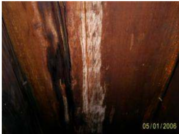
4.1 Picture 1

2x8 rafters deteriorated along valley (above Guest bedroom). Area still remains strong. Not cost effective to replace until next roof. Recommend a qualified contractor repair as needed at that time.