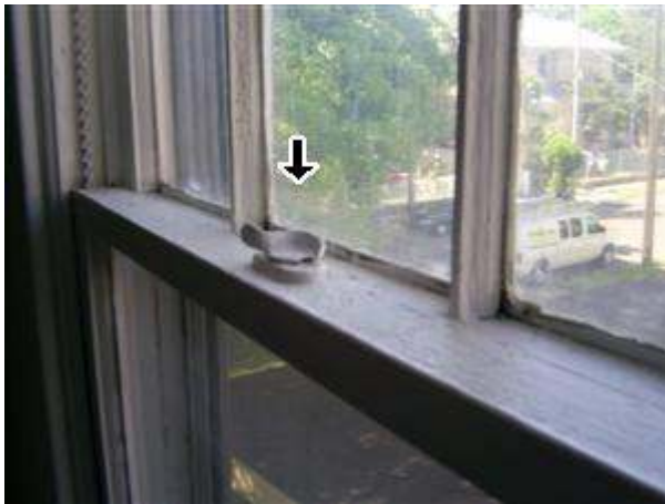
7.4 Picture 3