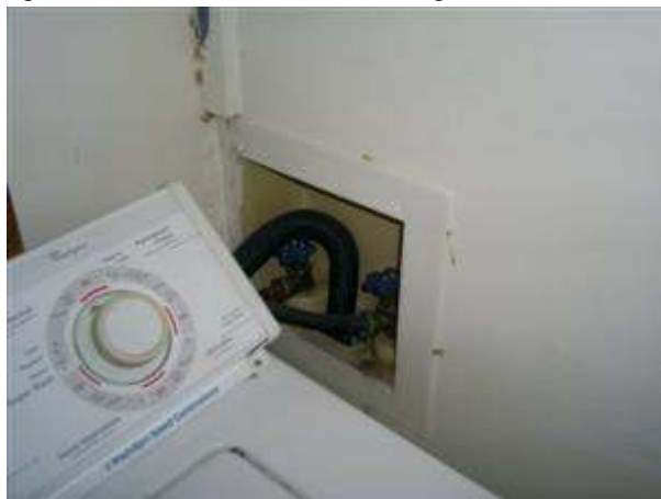
10.0 Picture 1

(Picture 1) Recommend replacement of the rubber washer hoses with braided steel hoses which are less likely to rupture and cause severe water damage to the home.