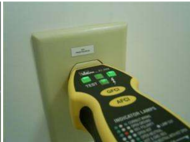
8.5 Picture 2