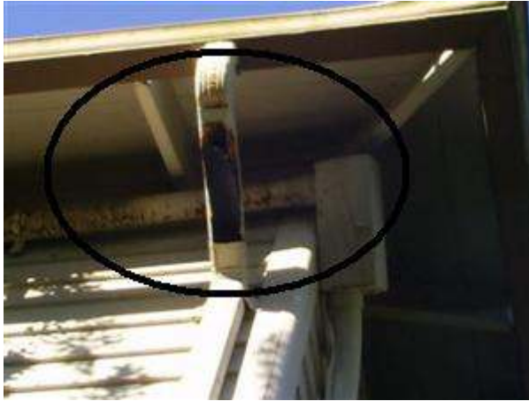
1.4 Picture 1