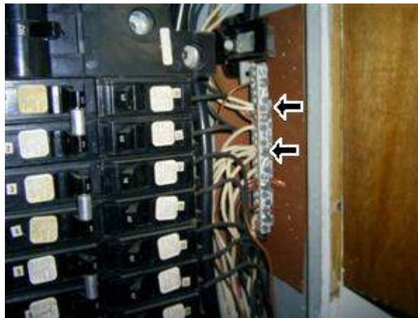
8.1 Picture 2