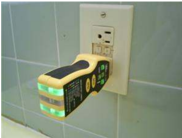
8.5 Picture 1

(Picture 1) This GFCI in the upstairs bath did not trip.(Picture 2) This GFCI in the upstairs powder did not trip (likely tied to the bathroom that was inop)