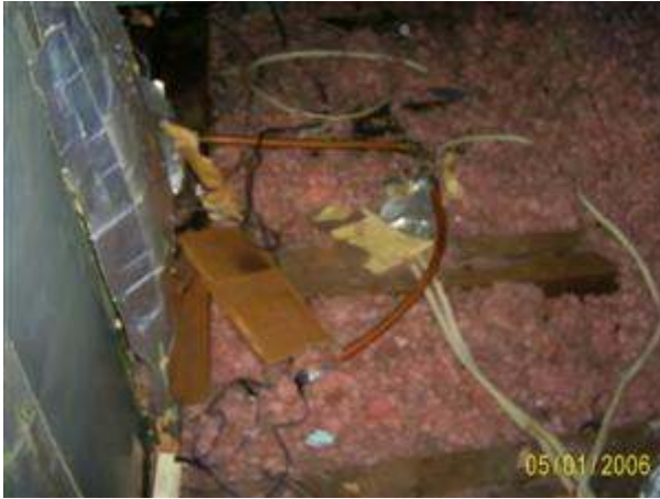
11.5 Picture 3