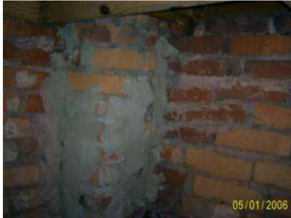
9.1 Picture 3