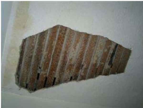
7.0 Picture 1

Plaster on ceiling is missing in areas at downstairs at hallway closet room. While this damage is cosmetic, it needs to be repaired. Recommend repair or replace as needed using a qualified person.