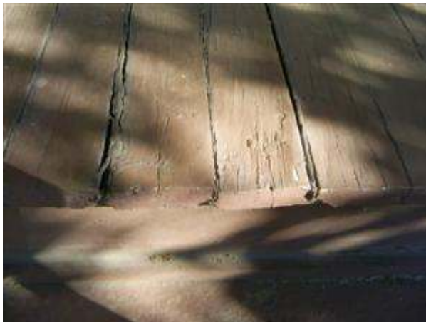
2.4 Picture 1

Wood floor decking on covered porch at front of home deteriorated. Further deterioration can occur if not repaired. Recommend repair or replace by a qualified contractor.