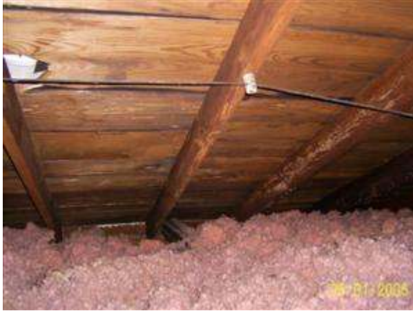
4.7 Picture 1

(Picture 2) Open junction box located too close to the scuttle hole (arrow points to opening of access) Recommend closing the box and repositioning to prevent physical damage. Recommend a licensed electrician perform all work that involves wiring.