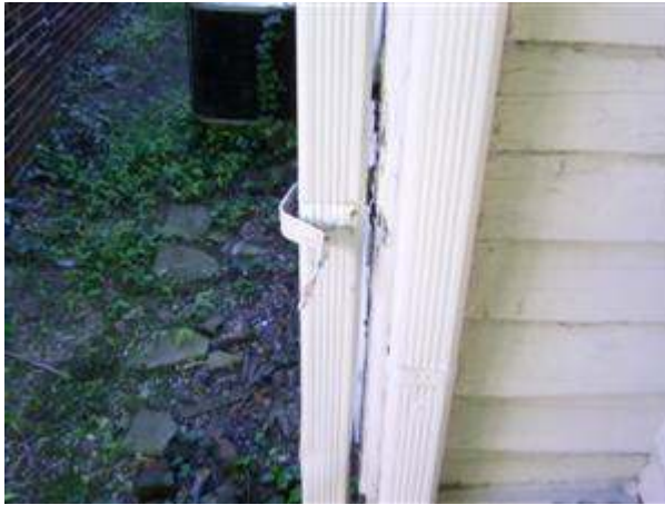
1.4 Picture 3

The roof of the home was inspected and reported on with the above information. While the inspector makes every effort to find all areas of concern, some areas can go unnoticed. Roof coverings and skylights can appear to be leak proof during inspection and weather conditions. Our inspection makes an attempt to find a leak but sometimes cannot. Please be aware that the inspector has your best interest in mind. Any repair items mentioned in this report should be considered before purchase. It is recommended that qualified contractors be used in your further inspection or repair issues as it relates to the comments in this inspection report.