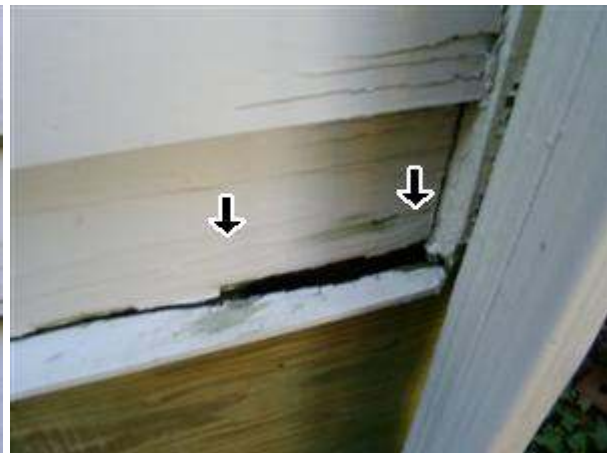
2.1 Picture 2