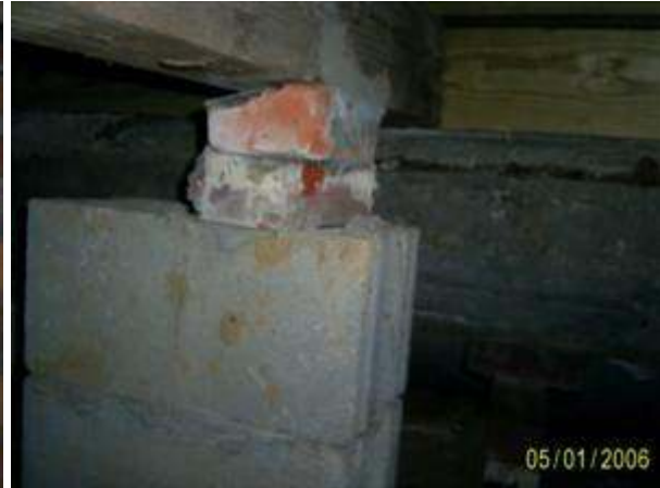
9.1 Picture 4