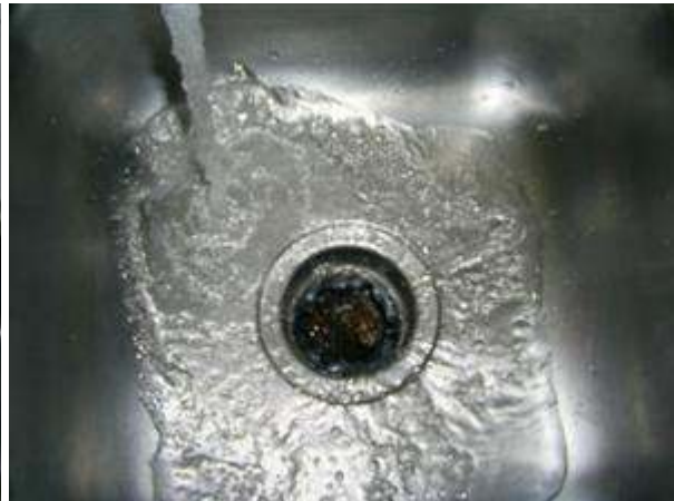
5.6 Picture 2