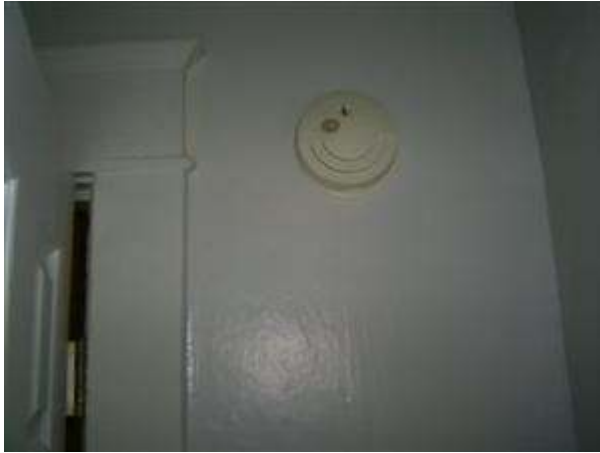
8.8 Picture 1