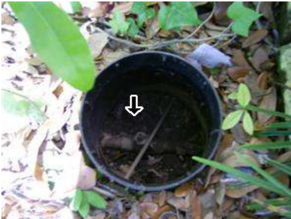
10.4 Picture 1

In front of the home. No knob (or lever) to actuate.