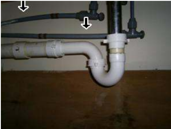
10.1 Picture 1

Polybutylene plastic plumbing supply lines (PB) are installed in the subject house. Polybutylene has been used in this area for many years, but has had a higher than normal failure rate, and is no longer being widely used. Copper and Brass fittings used in later years have apparently reduced the failure rate. This subject house has copper fittings and brass fittings. For further details contact the Consumer Plumbing Recovery center at 1-800-392-7591 or the web at http://www.pbpipe.com (Picture 2) Galvanized to PVC union not leaking at this time. Monitor this area for leaks.