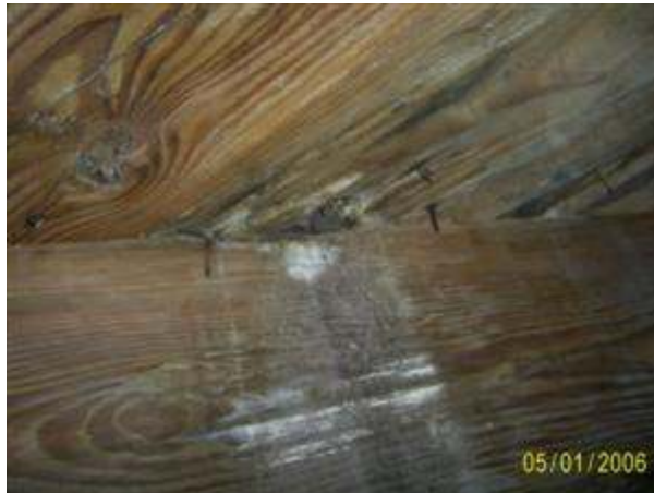
9.3 Picture 1

A couple areas of subfloor and the nearest joist shows signs of either water damage or damage by some other organism. This area is still hard or no longer actively leaking. Some of these areas may be candidates for replacement during renovations.