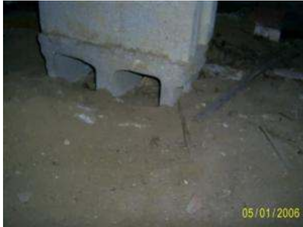
9.1 Picture 1

(Picture 1) (Picture 2) Several of the concrete block reinforcement piers were installed incorrectly. Original piers are still in place and still appear to be supportive as well. (Picture 3) Repaired area front left corner of the home. (Picture 4) Questionable support at the pier toward the middle of the porch area. (Picture 5) Good rim joist repair and ledger at the front of the home.