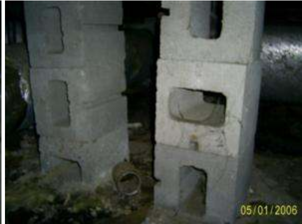
9.1 Picture 2