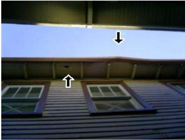
2.0 Picture 1

(Picture 1) Eave and gutter damage on side of the home. Recommend repair of the damaged areas.