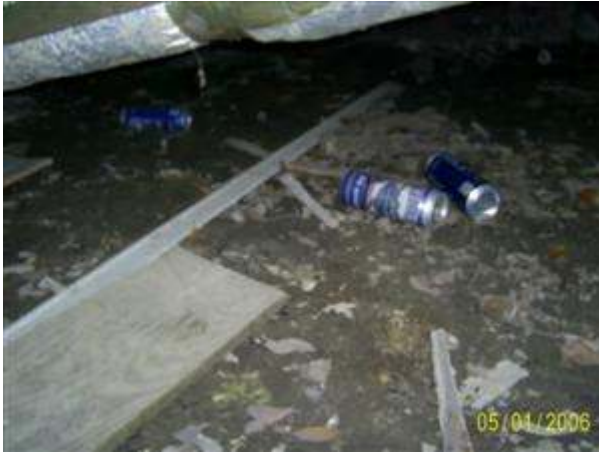
9.7 Picture 1

The structure of the home was inspected and reported on with the above information. While the inspector makes every effort to find all areas of concern, some areas can go unnoticed. Please be aware that the inspector has your best interest in mind. Any repair items mentioned in this report should be considered before purchase. It is recommended that qualified contractors be used in your further inspection or repair issues as it relates to the comments in this inspection report.