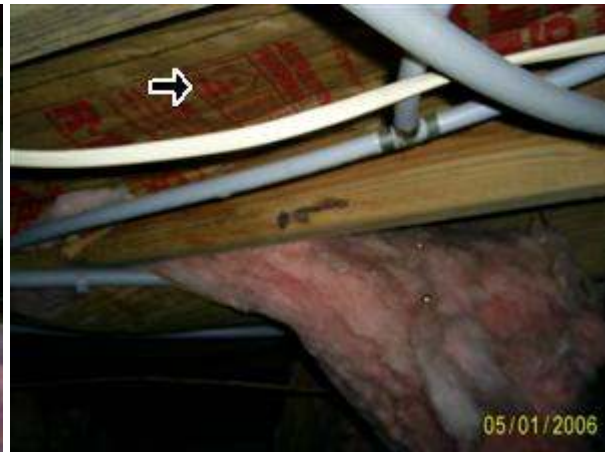
9.5 Picture 2