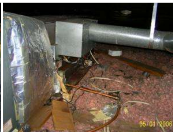
11.5 Picture 2