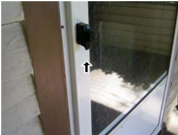
2.3 Picture 1

Broken handle on the downstairs unit storm door.