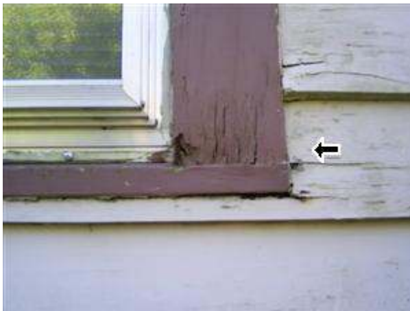
2.1 Picture 1

Water damaged siding in several areas of the home. Budget for repairs of these areas in the near future to preclude further deterioration.