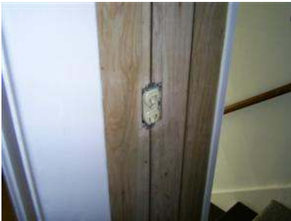
8.10 Picture 1

(Picture 1) No cover plate for the switches out side the upstairs bath.(Picture 2) Some of the Romex in the crawl is ran over gas lines as support, some is unsupported. Recommend repair by a qualified person.