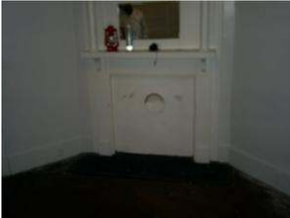
11.6 Picture 1

Currently closed off in the downstairs unit.