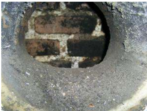
11.3 Picture 1