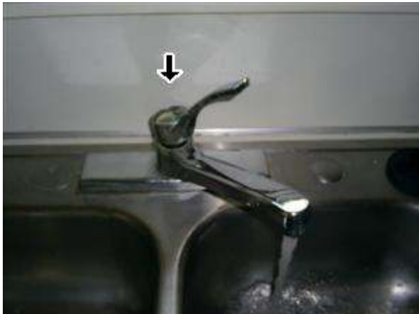
5.6 Picture 1

(Picture 1) Broken faucet top upstairs unit. (Picture 2) No rubber throat in the sink to disposal upstairs. Disposal (Kenmore) did not operate.