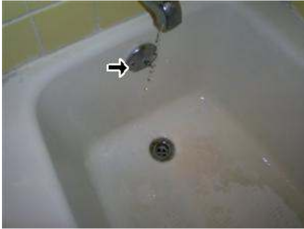
6.5 Picture 1