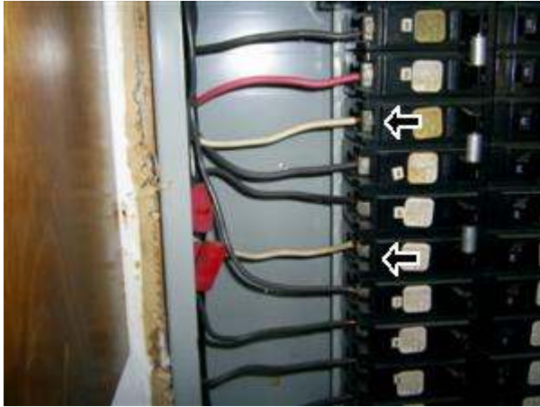
8.1 Picture 3