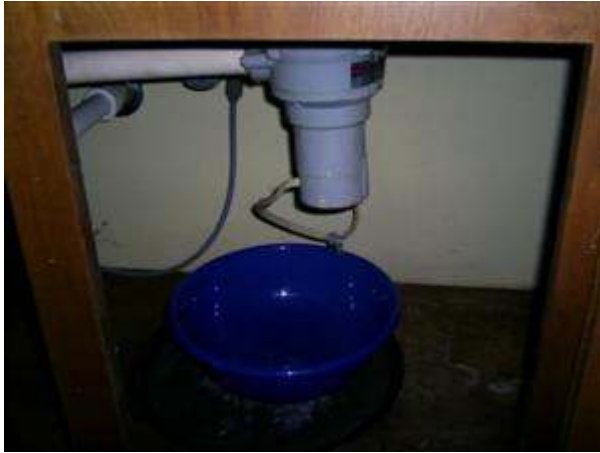
5.8 Picture 1