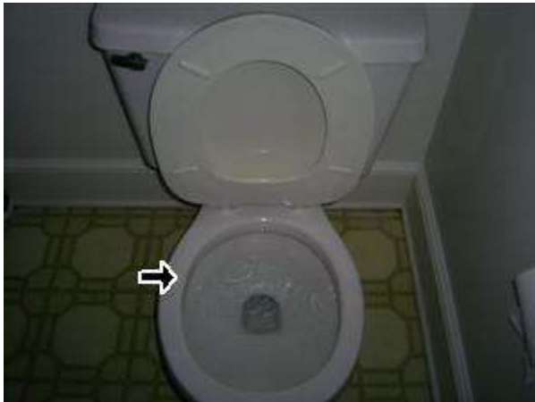
6.4 Picture 1

This toilet in the upstairs unit ran after being flushed. I turned it off with the twist valve. Recommend repair by a qualified person.