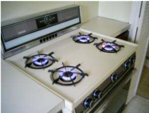
5.10 Picture 1

Comments: Inspected Both units had cook top burners that lit. Neither oven would heat up. Recommend repair by a qualified person.