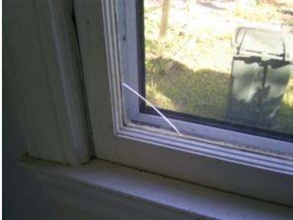
7.4 Picture 1

There are cracked glass in some windows throughout home.(Picture 3) Some windows upstairs missing the lock latch.