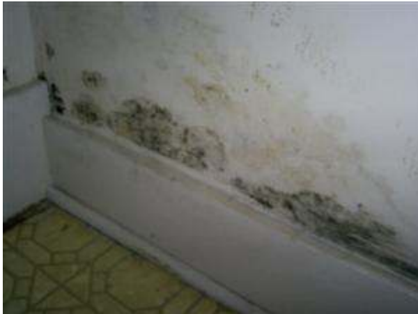
5.1 Picture 1

Signs of microbial growth present on walls along downstairs water heater room area in several areas. I did not inspect, test or determine if this mold is or is not a health hazard. The underlying cause is moisture. I recommend you contact a mold inspector or expert for investigation or correction if needed.