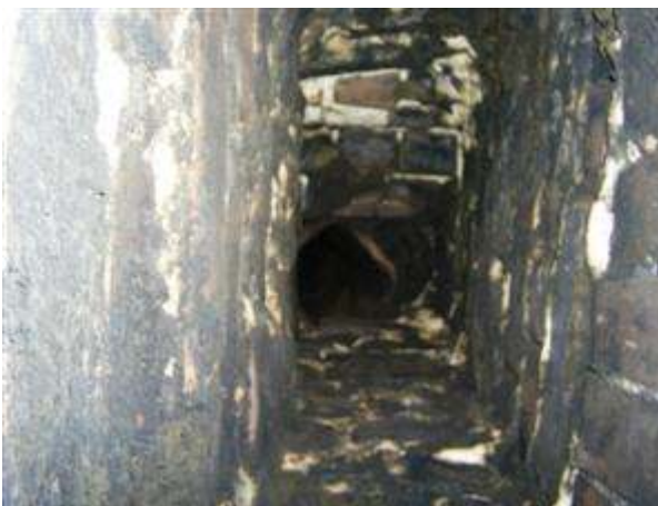
11.3 Picture 2