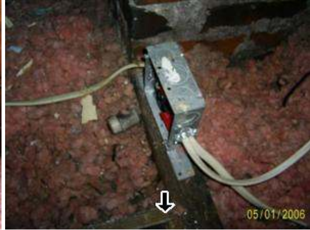
4.7 Picture 2