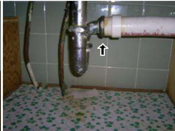
10.1 Picture 2