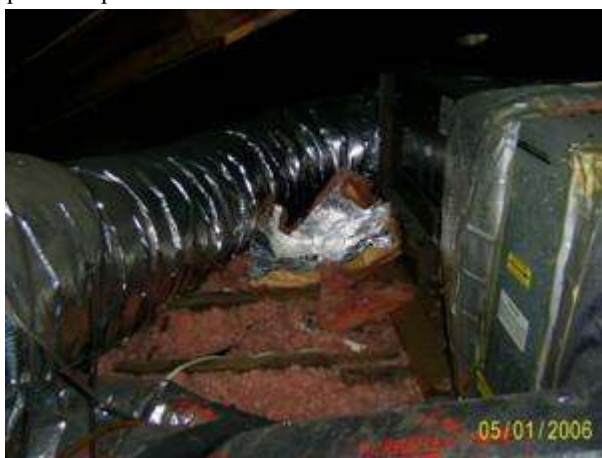
11.5 Picture 1

Debris all over the air handler unit in the attic. Recommend installer (if it can be determined who it was) clean the area up (regardless of any warranty) (Picture 4) This ductwork is laying on the ground. Recommend repair and support by a qualified person.