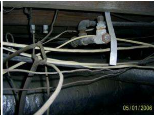
8.10 Picture 2

The electrical system of the home was inspected and reported on with the above information. While the inspector makes every effort to find all areas of concern, some areas can go unnoticed. Outlets were not removed and the inspection was only visual. Any outlet not accessible (behind the refrigerator for example) was not inspected or accessible. Please be aware that the inspector has your best interest in mind. Any repair items mentioned in this report should be considered before purchase. It is recommended that qualified contractors be used in your further inspection or repair issues as it relates to the comments in this inspection report.