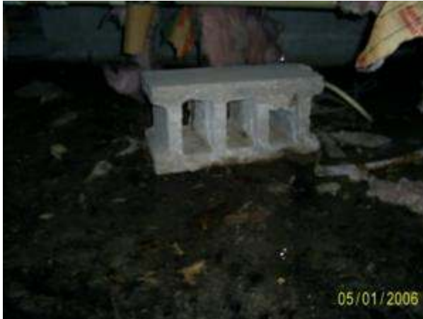
9.0 Picture 1

Long standing water present from a leak below and toward the rear of the lower kitchen.(Picture 2) Leak in the PB piping (drips in the air and along the pipe) ongoing. Recommend repair by a licensed plumber.