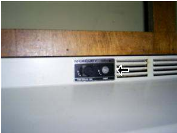
5.11 Picture 1

Comments: Inspected Missing the light knob. Still operates okay.