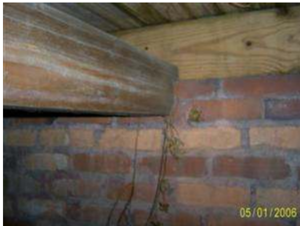
9.1 Picture 5