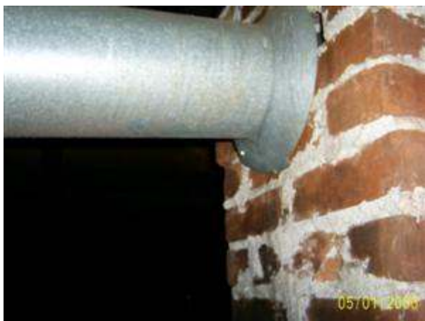
11.3 Picture 3