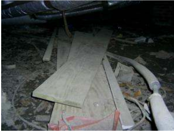
2.6 Picture 1