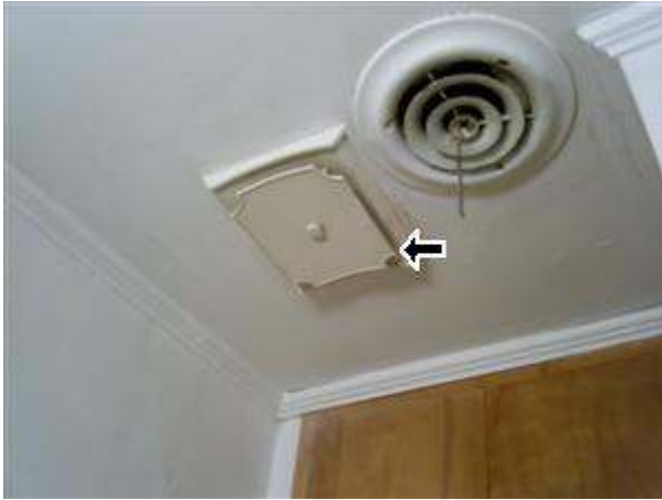
6.10 Picture 1