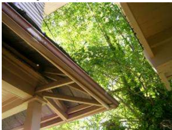
1.0 Picture 1

Roof covering is metal or tin and a metallic coating has been applied. The roof may need periodic maintenance of these coatings. (Picture 1) Tree limbs that are in contact with roof or hanging near roof should be trimmed.