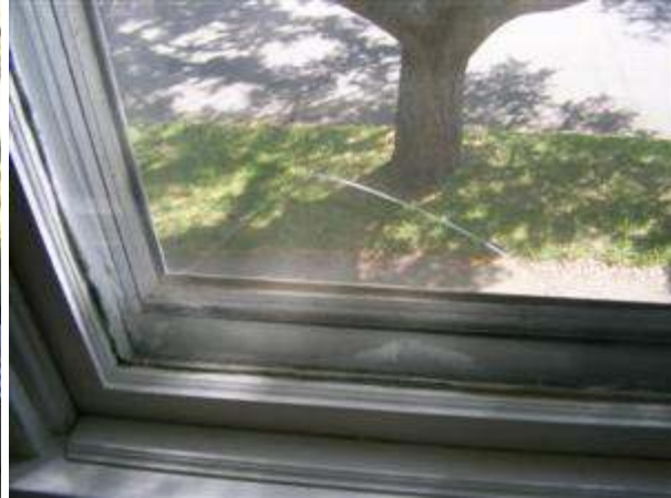
7.4 Picture 2