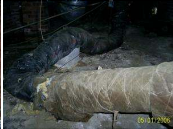
11.5 Picture 4