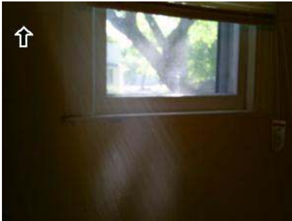
6.9 Picture 1

Shower head in the downstairs bath above the window. Water damage has occurred to this sill. Recommend raising the window above the shower line.