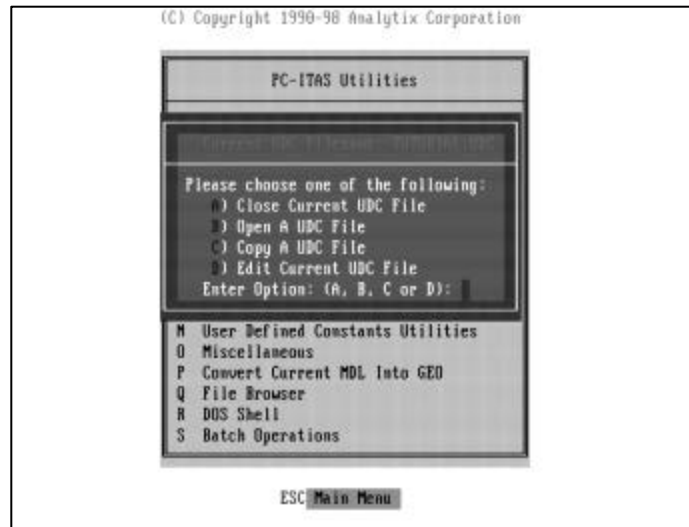
Figure 5-141. ITAS UDC Utilities

Figure 5-141 shows the UDC-related options. There is no limit on the number of the UDC files that may be accessed, however, only ONE UDC file can be open during an ITAS session, however, you may copy UDC variables from other UDC files into the current file.