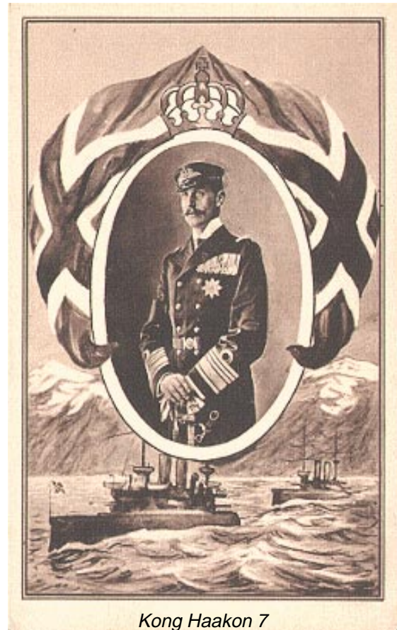
Kong Haakon 7

My father was a fair and upright man who could