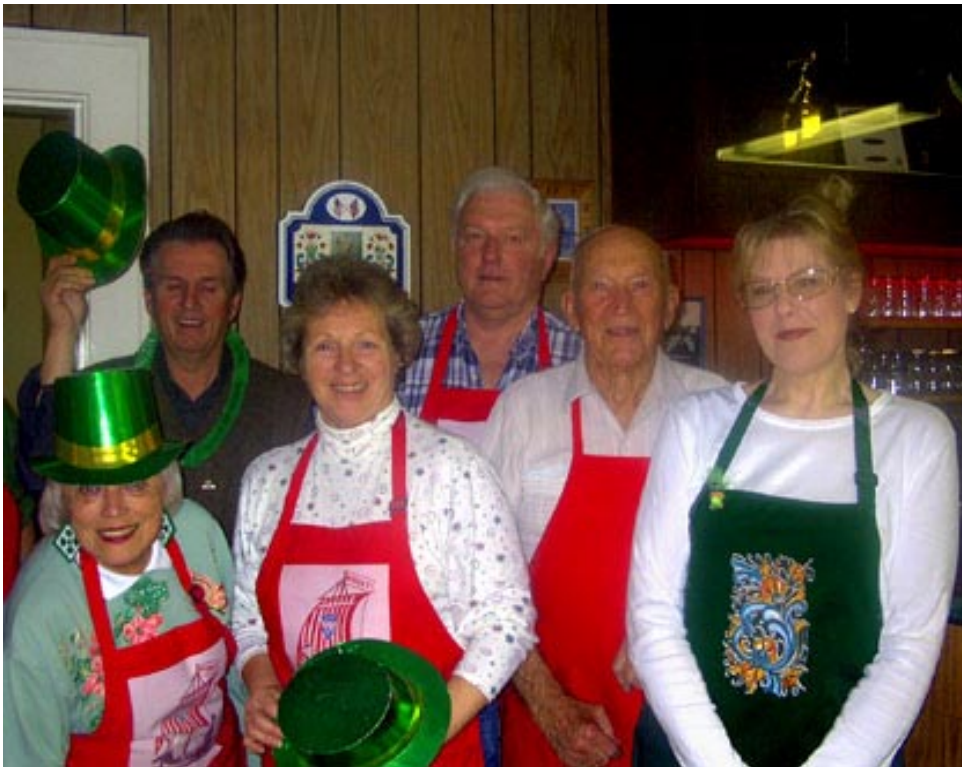
Some of the workers from our Corned Beef Dinner.