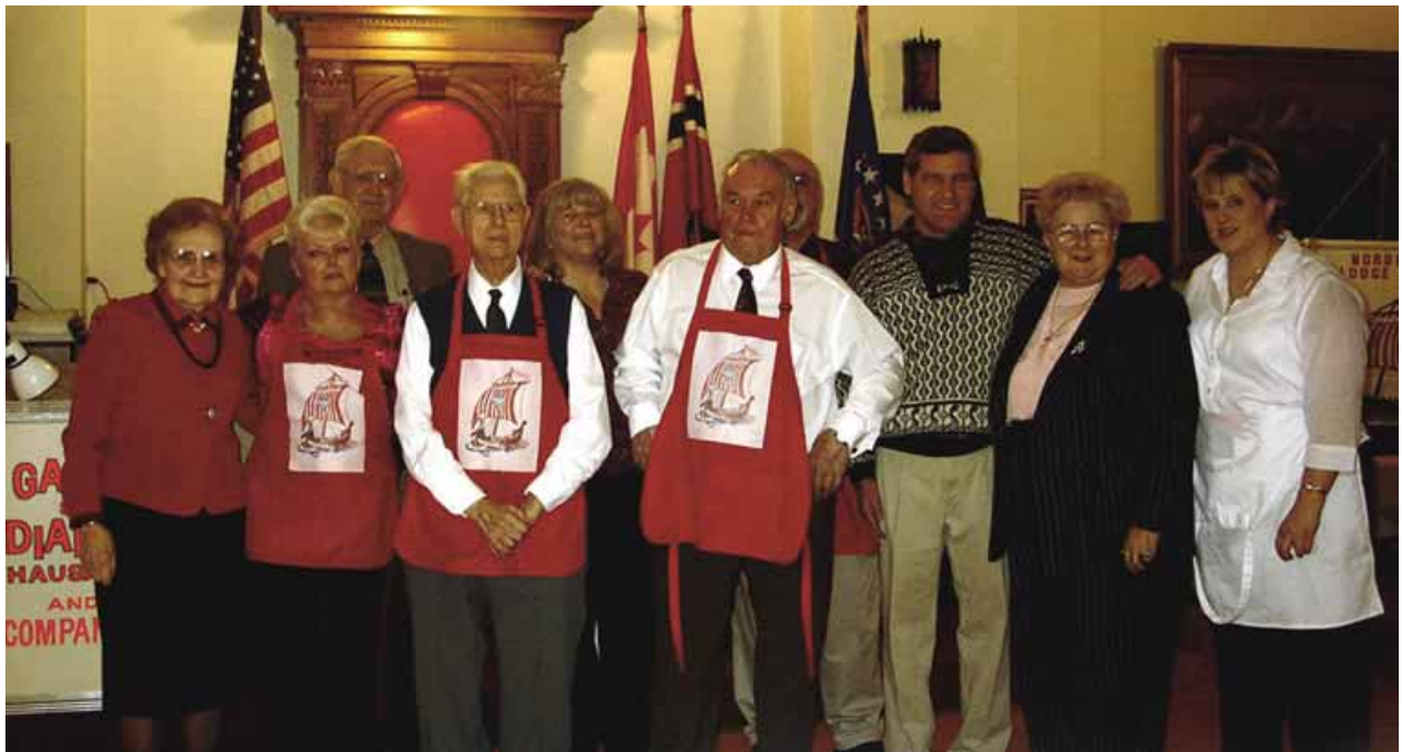
Cooks from the Febrary social pose for a picture.

She was a long time member of Gloria Dei Lutheran Church and the Sons of Norway. Knitting was her hobby and she was famous for her many projects.