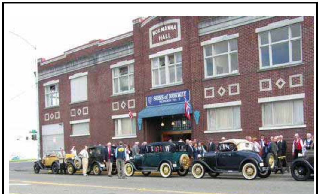
Model A's line up in front of Normanna Hall for our Centennial Celebration

Also visit our Bazaar, Bake Sale, Scandinavian Deli and Lefse demonstration