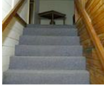
The stairway to the second floor, with two of the bedrooms along the way: much activity was witnessed here