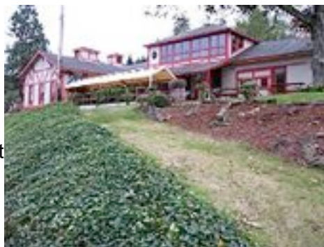
In the middle of bucolic hills and fields sits the quirky Nehalem Bay Winery