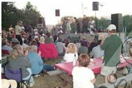
During the summer, the winery hosts large music festivals, like the Bluegrass 'n' BBQ every August

Her own experiences with the winery are quite varied, and include encounters in the tasting room where she could swear someone was walking behind her – and there was no one there – to hearing a man and a woman arguing upstairs, where the C.A.S.P.E.R. group had their biggest meetings.