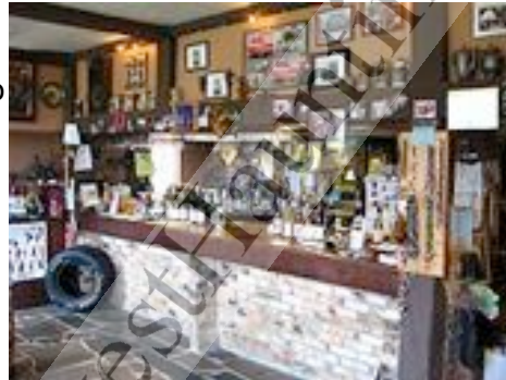
The tasting room at Nehalem Bay Winery