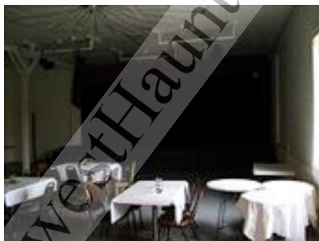
Somewhere in the dark, behind that wall, is the pitch-black corridor where the crew saw the shadow figure