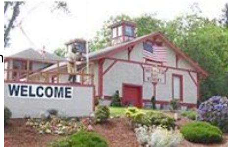
The public is very welcome here - living or otherwise, apparently