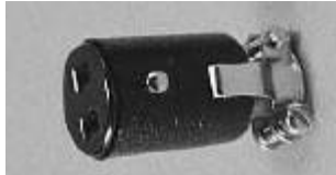
FEMALE CONNECTORS AT THIS END CINCH P/N S302CCT

Module main bus line wiring requirements: Use 18 AWG stranded wire minimum