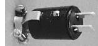
MALE CONNECTORS AT THIS END CINCH P/N P302CCT