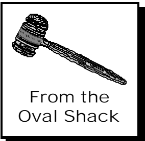
From the Oval Shack