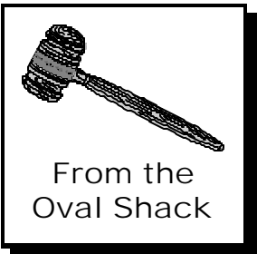
From the Oval Shack