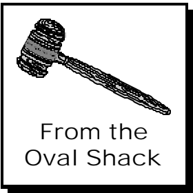
From the Oval Shack