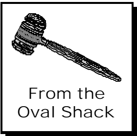
From the Oval Shack