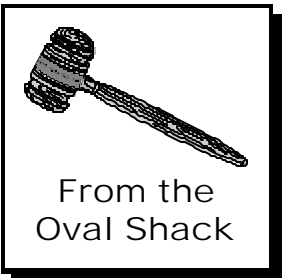
From the Oval Shack