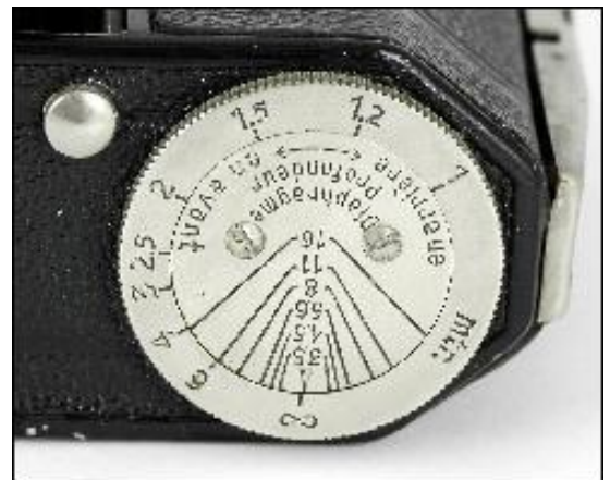
Depth of Field scale in French from 486935.