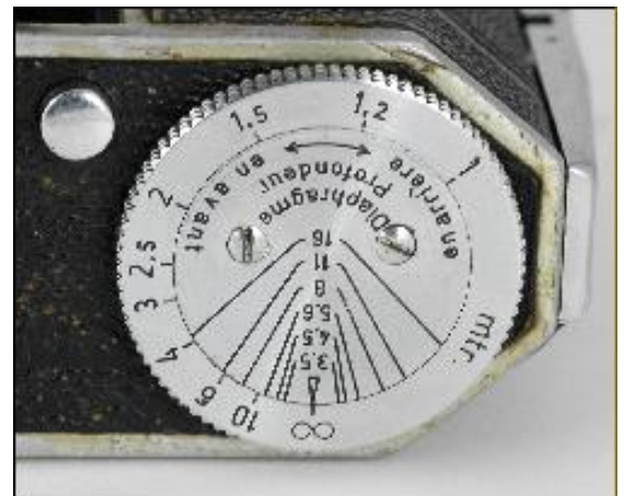
Depth of Field scale in French from 175723K.

A Typ 118 Retina camera was acquired from an eBay auction that had a KODAK ANASTIGMAT 1:3.5 F=5cms lens No. 15441 with an COMPUR-RAPID shutter and a French depth of field scale. This Typ 118 Retina is illustrated on the next page. Two additional versions of the Typ 118 with French lens are found in the HSRC database. The KODAK ANASTIGMAT lenses on Typ 118 cameras have a different serial number series and a different engraving style. See page 6.