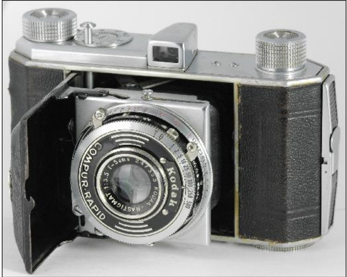
Typ 141 Retina I-- Body serial no. 175723K. with KODAK ANASTIGMAT 1:3.5 F=5cms lens s/n 247355

To date, no documentation or French advertisements have been acquired for the Typ 141 Retina I camera with KODAK ANASTIGMAT 1:3.5 F=5cms lens.