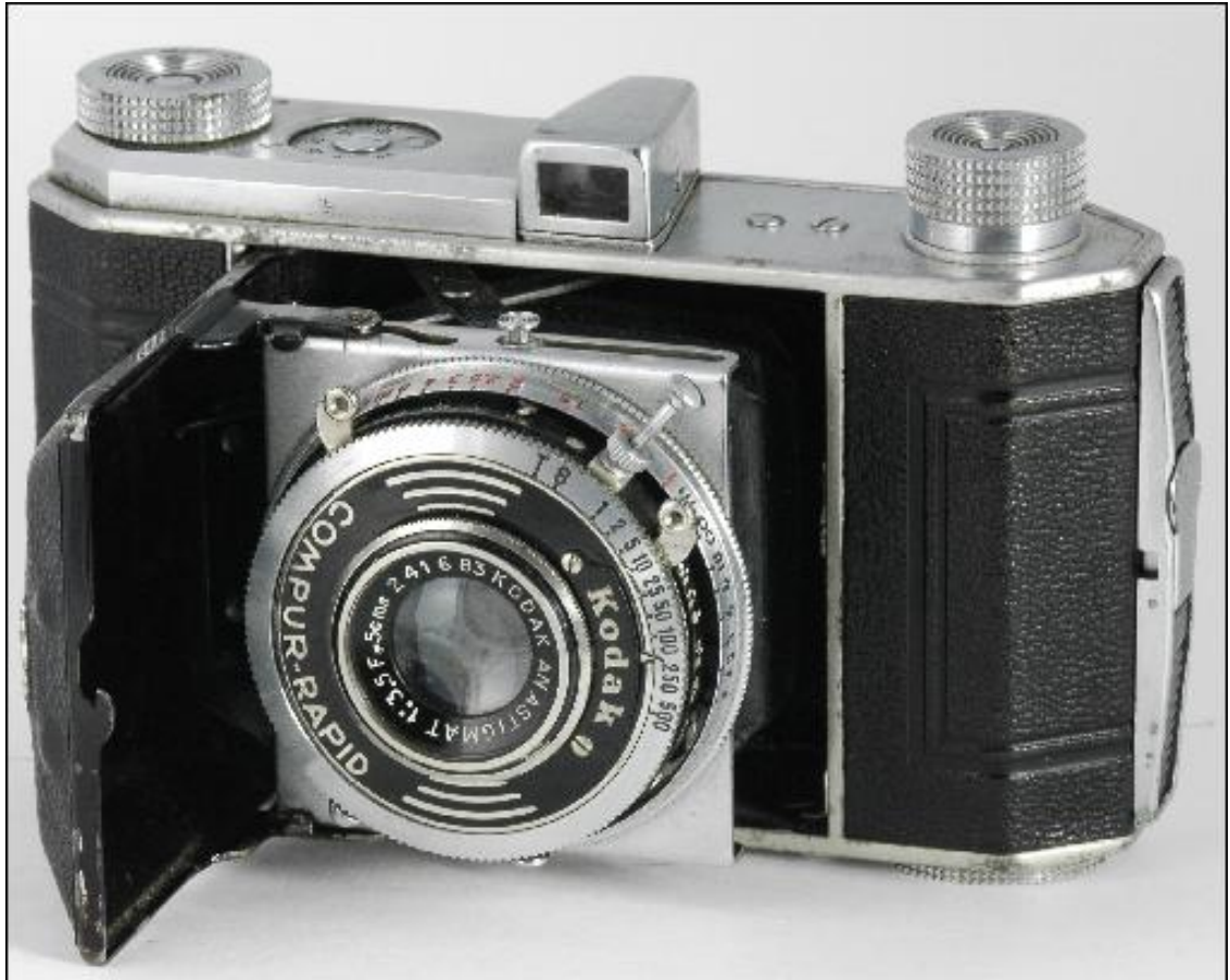
Typ 126 Retina I-- Body serial no. 53633K. with KODAK ANASTIGMAT 1:3.5 F=5cms lens s/n 241683

The author has acquired three Typ 126 Retina I cameras with the KODAK ANASTIGMAT 1:3.5 F=5cms lenses and COMPUR-RAPID shutters. All three cameras have French depth of field scales. Further research into other HSRC member collections revealed additional Typ 126 cameras with this lens and also a rare Typ 141 Retina I camera with this lens/shutter combination. A list of all identified pre-war Retina cameras with KODAK ANASTIGMAT 1:3.5 F=5cms French lenses can be found in table 1 on the last page of this Journal.