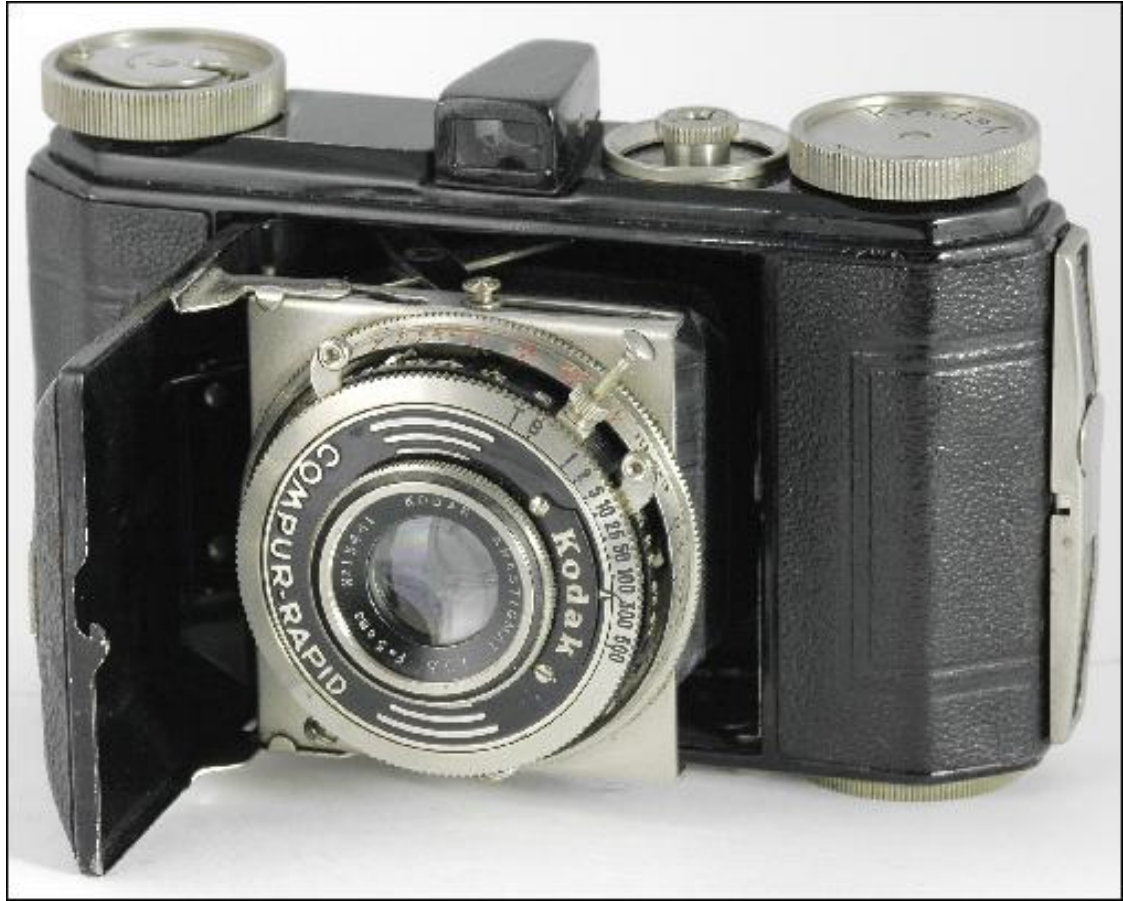
Typ 118 Retina I-- Body serial no. 486935. with KODAK ANASTIGMAT 1:3.5 F=5cms lens No. 15441