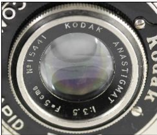
Close-up detail of different engraving style on Typ 118 lenses