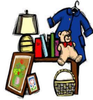
Attic Treasure Sale

Fund raiser sponsored by Presbyterian Women of CLPC