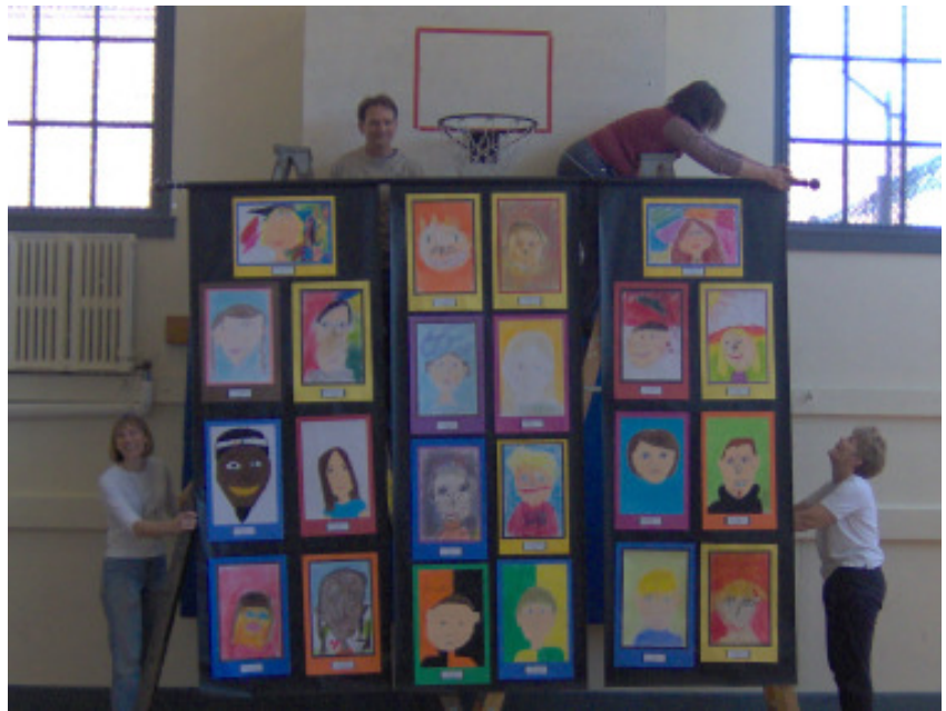
Parent volunteers brave their fear of heights to help transform the gym into an amazing art gallery.

Another successful children’s art show at Duniway!