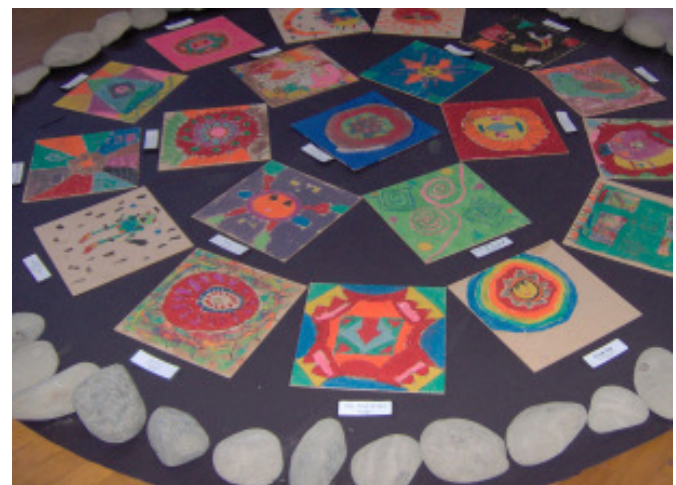
A new project this year - Tibetan/Navajo Sand Paintings, displayed in a circle on the floor.