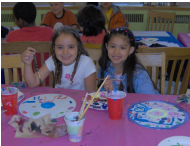
Creating musical paintings on recycled records.