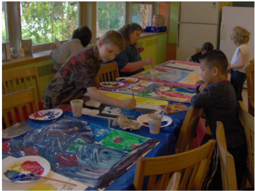
Painting a self portrait “in action” - doing something you love to do!

A residency for the Regional Arts and Culture Council (RACC)