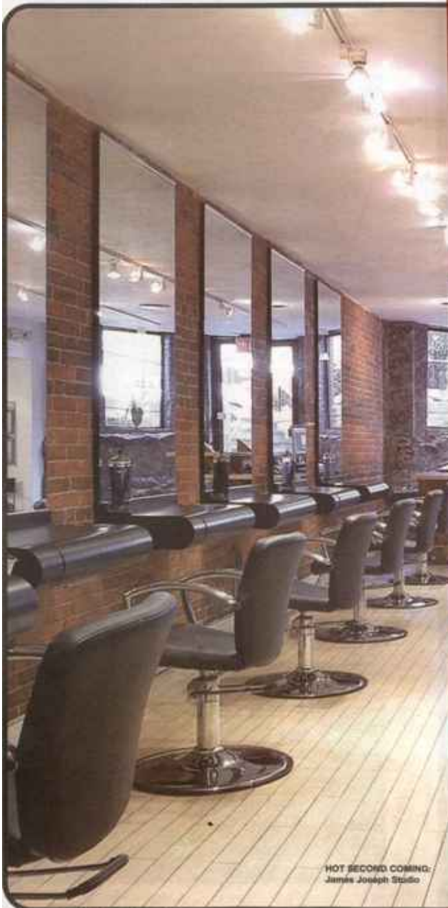
HOT SECOND COMING