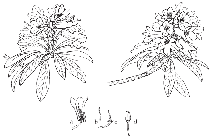
15. R. ferrugineum nat. size

—Ed. note: Maybe we will see some of these plants in the Hicks' collection.