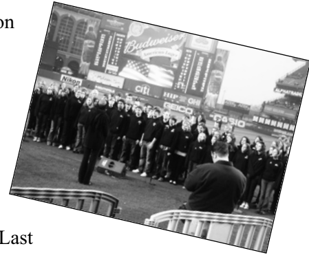
Shea Stadium New York City April 2008

P.S. I will follow up with a personal contact soon or you may telephone me at _____ at your convenience for more information.