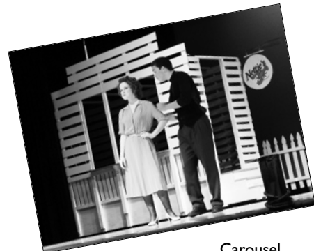
Carousel October 2008